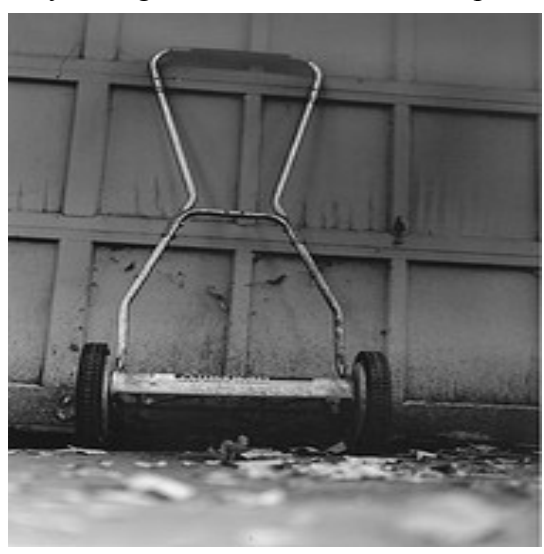
Universal Teachings For Everyday Living Page 2

Anyway from that Naikan realization moment, I believe my spirit was healed. I didn't really lose my mom three years ago. In a certain sense, her spirit is still